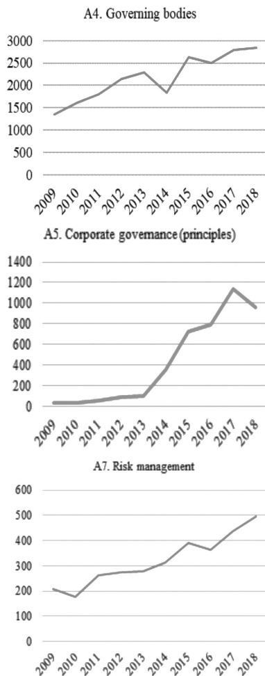
Fig. 2. Frequency of terms according to their groups in annual reports of extractive industry issuers for 10 years

Now we consider the case of mandatory information disclosure in annual report of the company “Alrosa”. “Alrosa” is the world leader in diamond mining. Its annual report for 2018 includes 260 pages. According to our ranking based on man-