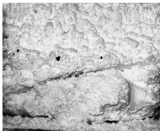
Fig. 2. Fragment of intumescent mastic (M 1 : 1 cm)

Fig. 3 shows the dependence of the temperature of the metalwork with unprotected mastic (1) and of the same design, but protected by fire retardant intumescent mastic at different optimum thickness (2–4). The calculations showed that when protecting metal structures with an intumescent fire-re-